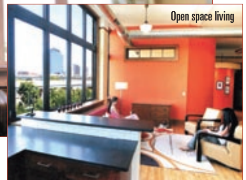
Open space living