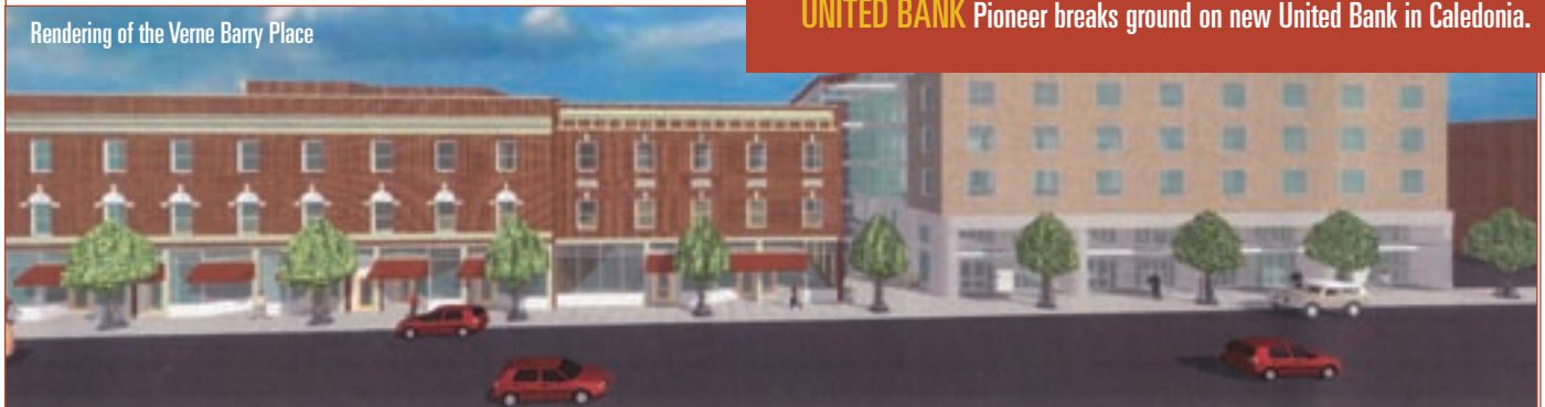
Rendering of the Verne Barry Place

The Dwelling Place has selected Pioneer Construction to build their new Verne Barry Place facility on Division Street in downtown Grand Rapids. The Dwelling place is a non-profit organization based in Grand Rapids focused on providing affordable housing opportunities. The new Verne Barry Place will be a LEED Certified Green Building. The new five-story building will include apartments, green roof patio, retail space and covered parking. The project also includes the renovation of three historical buildings which were originally hotels built in the early 1900s. Local architect DTS Winkelmann is leading the design effort.