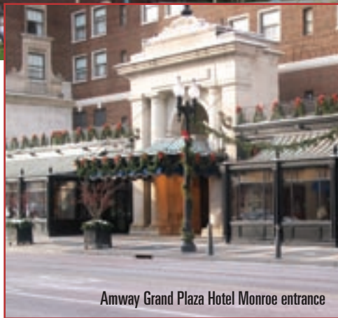
Amway Grand Plaza Hotel Monroe entrance