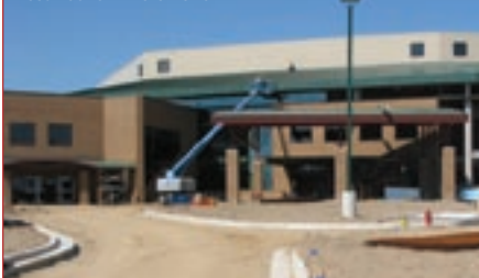
Resurrection Life exterior

The five-story addition to Resurrection Life Church will seat 4,000 and accommodate several new classrooms and areas for mechanical services. One of the more striking features of this project is the use of multiple exterior finishes — brick, exposed concrete, curtainwall, metal panels, and stone — to create a visually dramatic facade. Pioneer's average daily manpower on this job is 115 workers.