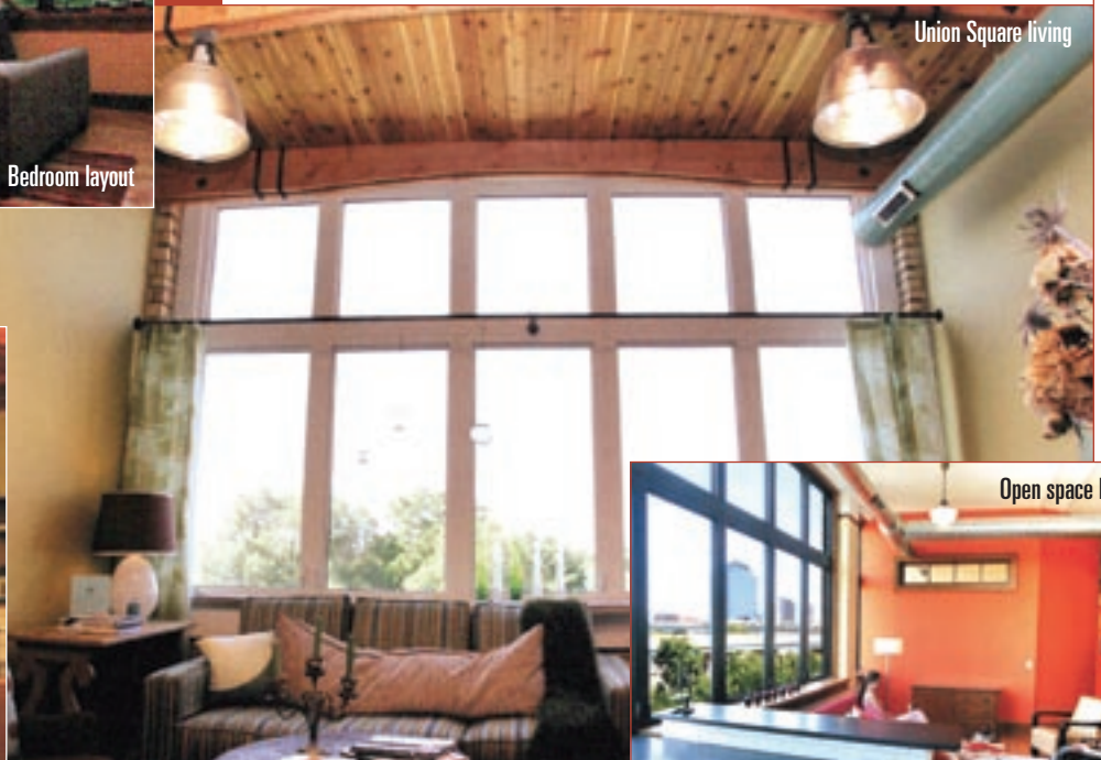
Union Square living