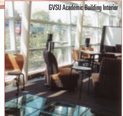
GVSU Academic Building Interior