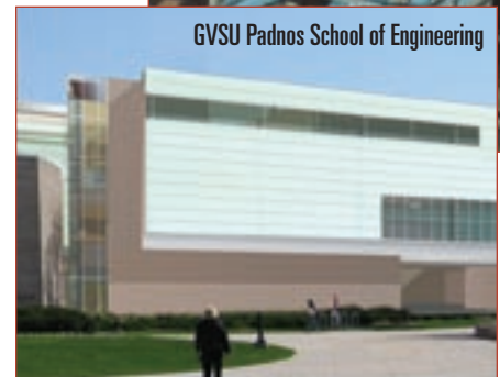
GVSU Padnos School of Engineering

Planning and Design is well underway on the expansion of the Padnos School of Engineering on Grand Valley's Pew Campus in Downtown Grand Rapids. The new three-story building will include 50,000 square feet of Engineering Labs, Computer Labs, Classrooms, and Faculty Offices. The building will ultimately be LEED certified by the US Green Building Council. Progressive AE of Grand Rapids is designing the new facility.