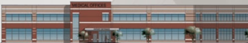
Rendering of the Medical Office Building

The building's core and shell is complete and construction of nearly 35,000 square feet of medical office suites is now underway. The new medical office building is attached to the Zeeland Community Hospital currently under construction and scheduled to open in the spring of 2006. The Zeeland Community Hospital Family Life Offices will be among several tenants in the new medical office building with an opening to coincide with the new hospital.