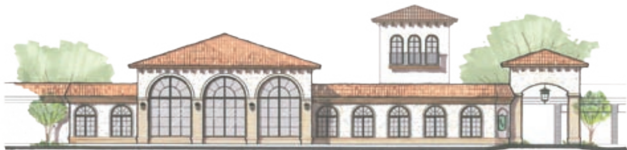
Rendering of Spring Lake Country Club

The design-build team at Pioneer began preliminary design for the Spring Lake Country Club expansion in January of 2005. The first phase, a new outdoor dining area, was completed in May and ground was broken in November on the 4,500 square foot ballroom addition scheduled for completion in May 2006. The original Spanish Mediterranean-styled clubhouse was built in 1927. The new addition will complement the original architecture with tiled roofs, arched windows and stucco façade. Among many other improvements, the $1.2 million expansion and renovation will double the size of the existing ballroom and provide banquet room seating for more than 400 people.