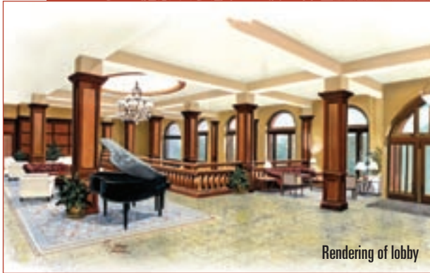
Rendering of lobby

With the assistance of Pioneer Construction and Cornerstone Architects, Second Story Properties will restore a century old building (constructed in 1914) into 56 downtown condominium residences. The Fitzgerald is located in the heart of Grand Rapids' art and theatre district across from the spectacular Grand Rapids Public library. Amenities include covered parking, green roof, indoor swimming pool, exercise room, and many units with balcony views. The restoration of The Fitzgerald will begin in spring 2006 and is scheduled for completion in early summer 2007. Information on this property is available from Donna Dozeman at 616.458.5235.