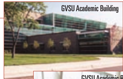
GVSU Academic Building

The New GVSU Academic Building is the latest "Green Building" constructed on the university's campus in Allendale, and it won't be the last. Earlier in the year, Governor Jennifer Granholm announced that all construction projects built using state funding are required to use Green Building techniques. Always staying one step ahead, Grand Valley had made the decision to go green back in 2004 because of their commitment to our environment. 85% of all construction waste materials were recycled on the project. Design Plus Architects of Grand Rapids was the designer.